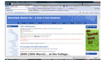
Why not visit our blog page at http://numurkahpaststudentclub.edublogs.org/ .

Don't know what that is? Would you like to learn? Why not join us at the yearly get-together and find out how? See details elsewhere in this newsletter.